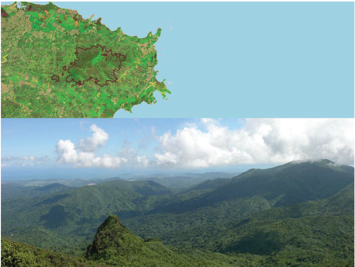
Figure 1. Recent (2010) aerial photo mosaic of Puerto Rico with the outline of the Luquillo Experimental Forest encompassing the peaks of the Luquillo Mountains in northeastern Puerto Rico (top panel). The bottom panel is a view to the northeast from El Yunque Peak in the Luquillo Mountains.

Terborgh 1971) that can then be contrasted among taxa (Presley et al. 2012) or over time (Rowe 2007, Moritz et al. 2008). Indeed, elevational gradients represent substantial changes in temperature, rainfall, cloud interception, soil, and wind exposure, with environmental conditions at the extremes that strongly challenge species tolerances in both evolutionary and physiological contexts (Grubb 1977, Cavalier 1986). Compared to temperate organisms, Janzen (1967) reasoned that tropical organisms should respond more strongly to environmental changes along elevation gradients because, from an evolutionary perspective, such organisms face little intra-annual variation in climate and, therefore, are more sensitive to other forms of environmental variability. If true, then environmental responses to global change drivers on tropical mountains may provide an early indication of what the future holds for many of the world's ecosystems. In addition, human alteration of the earth has accelerated dramatically in the past century (Hannah et al. 1994). A preliminary inventory of human disturbance of world ecosystems has de-