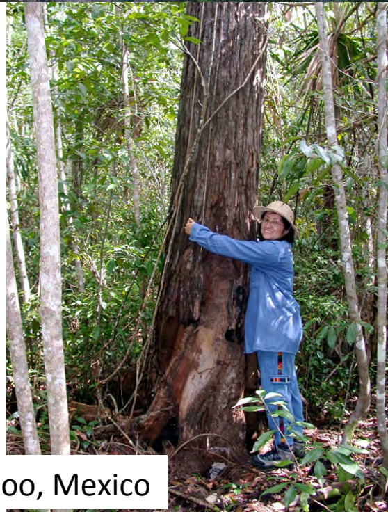
Quintana Roo, Mexico