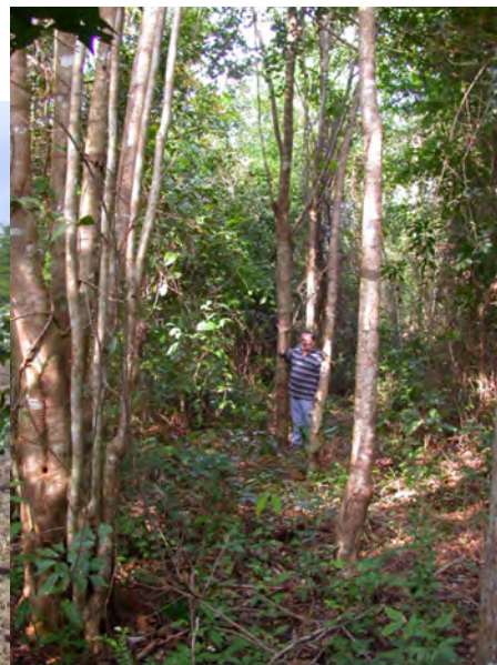
Fazenda Tramontina, Pará, Brasil