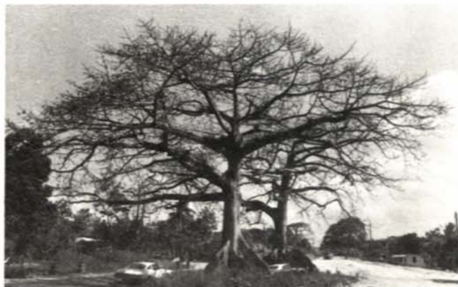
Figure 1.—Trees of ceiba ( Ceiba pentandra ) after leaf fall.